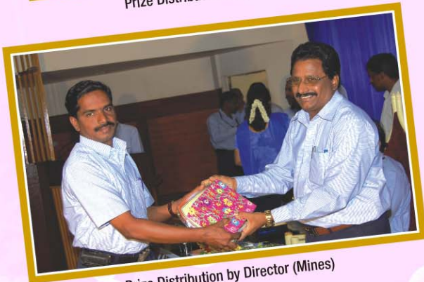
Prize Distribution by Director (Mines)