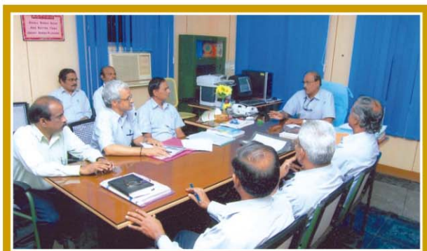
Joint Inspection cum Discussion meeting at Central Technical Officers, Neyveli

During the Vigilance Awareness week, joint inspections were conducted at different units and also at Barsingsar Project of NLC by the Vigilance officers along with nominated executives from various units in the morning sessions.