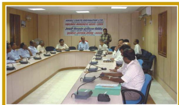
Joint Inspection cum Discussion meeting at Barsingsar

During the Vigilance Awareness week, joint inspections were conducted at different units and also at Barsingsar Project of NLC by the Vigilance officers along with nominated executives from various units in the morning sessions.