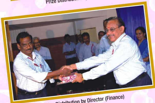
Prize Distribution by Director (Finance)