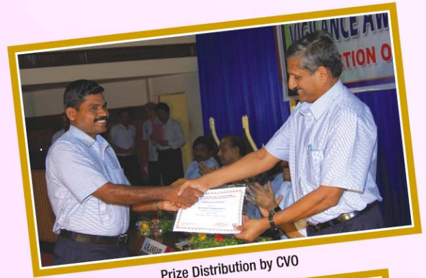
Prize Distribution by CVO