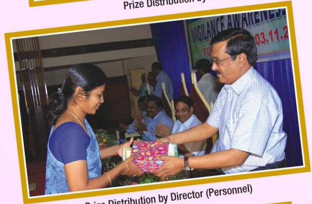
Prize Distribution by Director (Personnel)