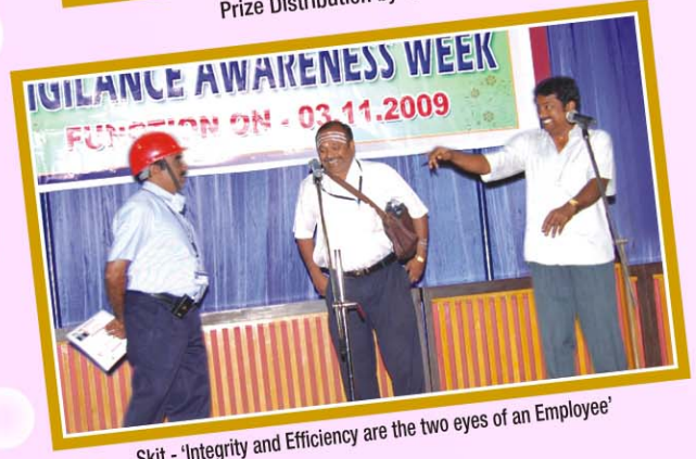
Skit - 'Integrity and Efficiency are the two eyes of an Employee'

NLC Vigilance Website : To send Information / Complaints with identity to this branch, log on to NLC Intranet and also email to cvo.nlc@nlcindia.com