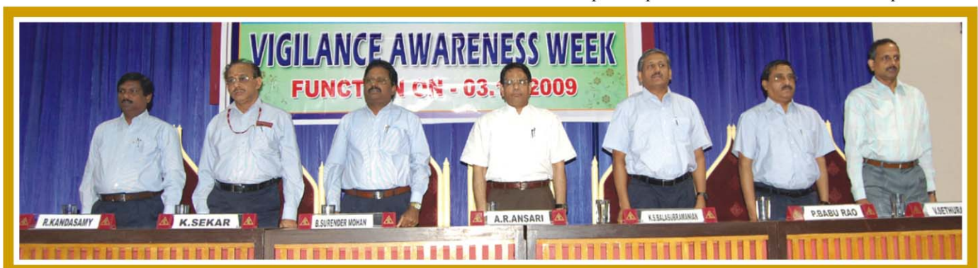
CMD, Directors & CVO at the Vigilance Awareness Week function

A public function with the NLC Chairman-cum-Managing Director as the chief guest, in the presence of the Directors of the company was held in the afternoon on 03.11.2009. The highlights of NLC Vigilance activities during the year 2008-09 were read out. The updated 'Compendium of CVC Circulars up to September 2009' and 'Annual Report' of the