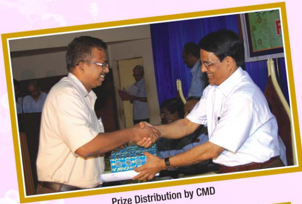
Prize Distribution by CMD